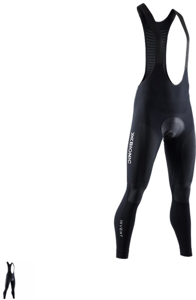
X-BIONIC INVENT 4_0 CYCLING BIB PANTS PADDED MEN'S.jpg

X-BIONIC INVENT 4_0 CYCLING BIB PANTS PADDED MEN'S